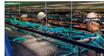
CAC was selected as training partner for the NSF's Leadership-Class Computing Facility. LCCF will deploy a supercomputer in 2026 with 10 times today's performance (100 times for AI). CAC also leads a pilot project to improve the sharing and accessibility of HPC training and education across the nation.